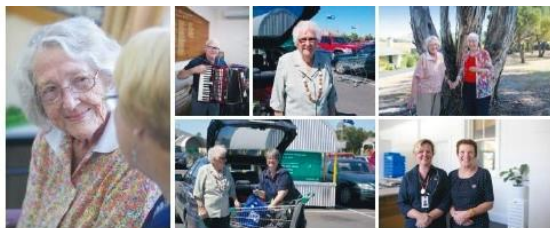
Celebrating our Seniors

South Eastern Community Care proudly invites the whole family to the 2017 SEC Care Community Expo!